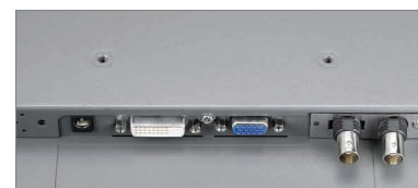
Looping BNC video connector for multiple display connections