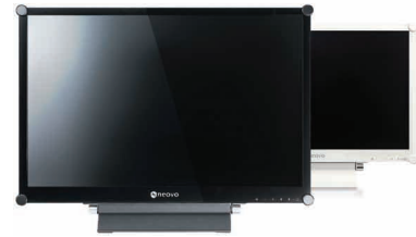
Available in black or white