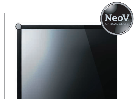
NeoV™ Optical Glass for hard glass protection and strong metal casing for secure mounting